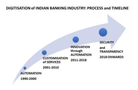
Figure 1: Digitisation of Indian Banking Industry

By 2014, there was ample advancement in technology for the banks to manifest their existence in digital space and enhance their reach to provide financial services seamlessly. However, due to limited understanding of the digital platforms there were very few takers for such services. The 'pandemic' proved to be the catalyst and resulted in people adopting the digital banking services to avail financial services. Integration of banking and digitization has improved access to credit, risk management and entrepreneurial growth in the Indian economy. The banking sector is equipped to prove its calibre in achieving financial inclusion to keep up with the changing times.